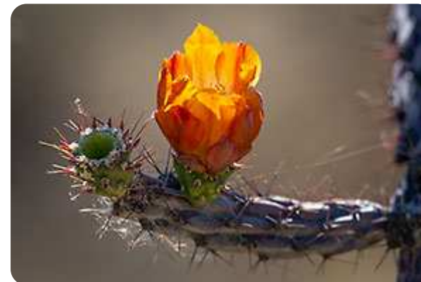
Arizona-Sonora Desert Museum - Tucson