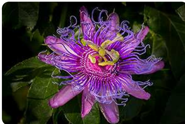
Arizona-Sonora Desert Museum - Tucson

I've been in the Desert Museum 18 years ago and in my memories it was so nice that it was a kind of „must have“ on this year's agenda. The museum is a mixture of garden and zoo and there is so much to see that I'm here for nearly 4 hours. They have hummingbirds (including two sitting