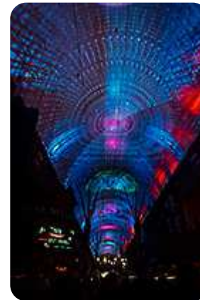
Freemont Street - Las Vegas

I time my visit to the Freemont Street Experience in a way that I'm there early enough for the 8pm show and still have some time to find a decent spot to place my tripod. Indeed, it's not as complicated as I was afraid. Given that it's Saturday evening the street is not too crowded. The show is kind of nice. They play three different songs and animations are