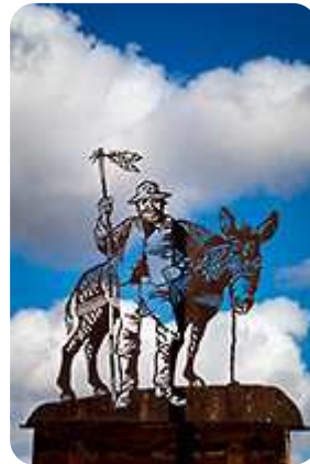
Goldfield Ghost Town - Apache Junction

ry with more than 3000 butterflies. The space is not huge, but this means that you are surrounded by butterflies wherever you go. If you love butterflies this is definitely a place to go. I spend here more than two hours (plus a coffee break). Next to Butterfly Wonderland is an aquarium, a mirror maze and some other locations. You can get some combi-tickets if you like but I was fine with the butterflies.