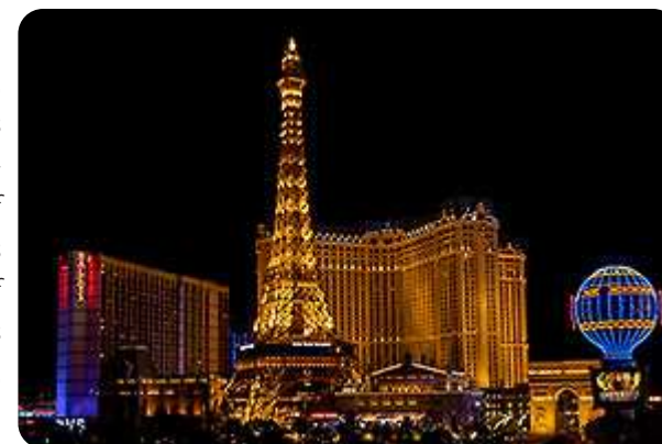
Paris - Las Vegas

lines at the Las Vegas Welcome Sign, no matter what time of the day, there is a long way to go. But at least 10 cars join the parking lot with me. Unfortunately,