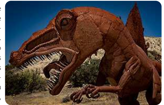
Ricardo Breceda Gallery and Sculpture Garden

At 4 I'm ready to go. I've downloaded a map with the locations, but that wasn't necessary – just follow the crowds. There is not a lot to do here, so whoever comes to this place is going to visit the sculptures. It's not really bad, therefore this place is still too remote, but if you think you're going to be alone,