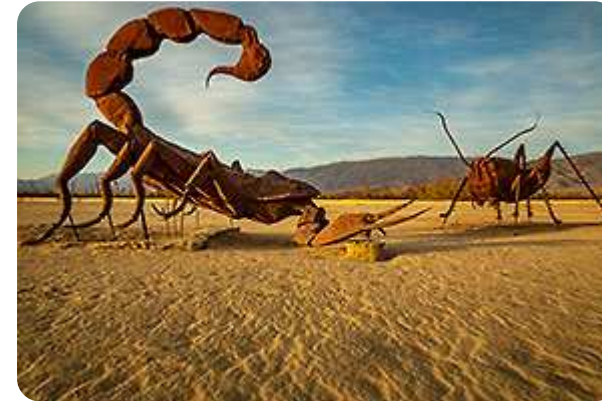
Galleta Meadows - Borrego Springs

ed in the same way. The only topic is God, Jesus and the Bible. If this is really art you have to answer on your own. Worth a visit it is for sure.