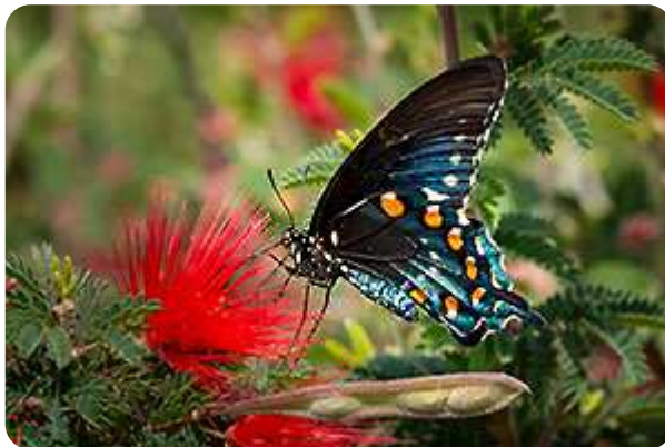
Arizona-Sonora Desert Museum - Tucson

one till Phoenix. As it's still too early for check-in I go directly to my next destination: Butterfly Wonderland in Scottsdale. They claim to be the biggest conservato-