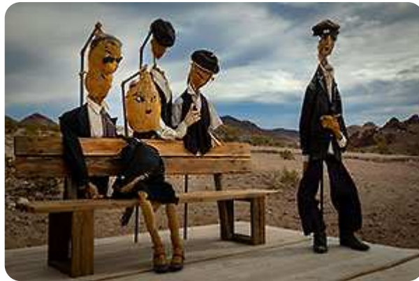
Rhyolite Ghost Town

shown on the huge screen above. Nothing to talk about. Maybe they should send the responsible guy to China, so he understands how it could look like.