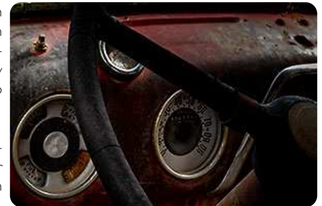
Goldfield Ghost Town - Apache Junction

thought about going for the detour to Watson Lake anyhow, but the way to Page is long and the sky is not brightening up.