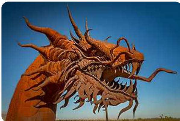
Galleta Meadows - Borrego Springs

so big that I ask if this is really for one person only.