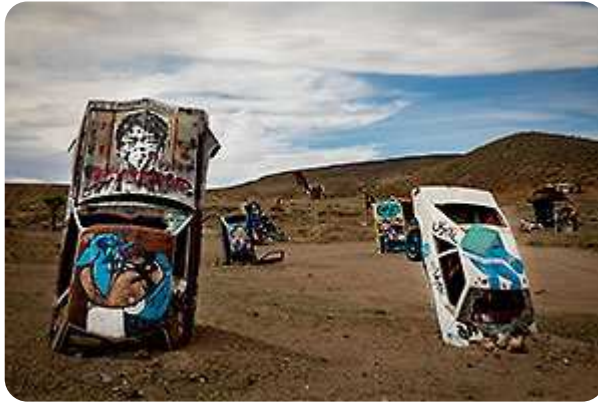
First international car forest of the last church - Goldfield

Today it's road trip day 2 and I'm going south-east. It will be a pretty touristic trip; most places are mainstream nowadays.