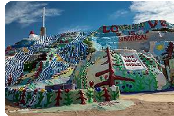
Salvation Mountain - Niland

Now the longest drive to come from A to B has to start. I'm going all the way to Tucson with just a short stop to see the