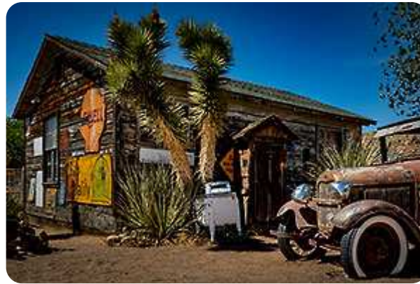
Hackberry General Store