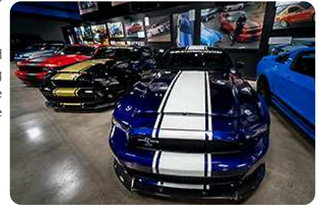
Carroll Shelby Museum - Las Vegas