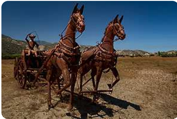
Ricardo Breceda Gallery and Sculpture Garden