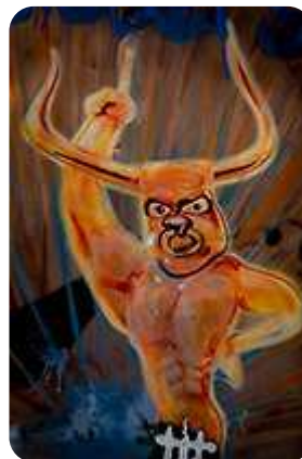
First international car forest of the last church - Goldfield