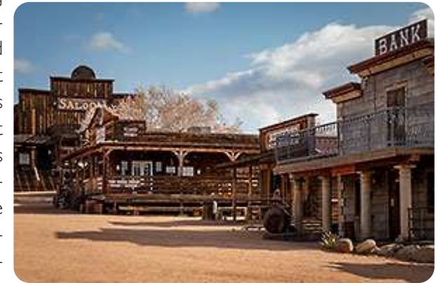
Goldfield Ghost Town - Apache Junction

The light was good for some 30 minutes, then some dark clouds moved in. I briefly