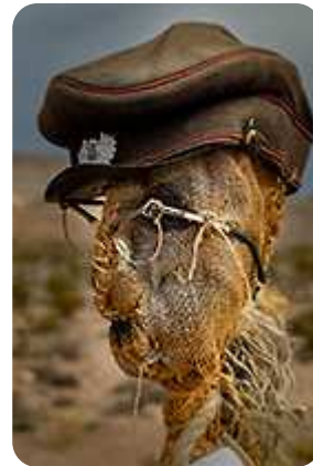
Rhyolite Ghost Town

aside of that street-musicians are allowed to play as well. In the end it's a cacophony of everything and nothing. Most probably you can enjoy that only with several drinks from one of the many open-air bars you can find at the side of the street. I walk the street from one end to the other and back again. That's more than enough and as there is not a lot to see in this area aside of that, I return to my hotel room soon.