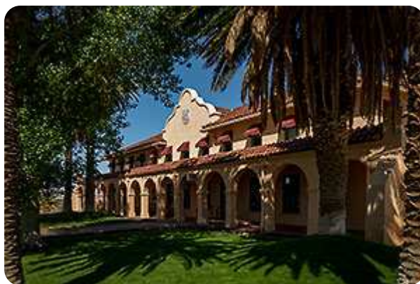
Kelso Depot and Visitor Center

through the Mojave National Preserve instead of taking the Interstate. The area