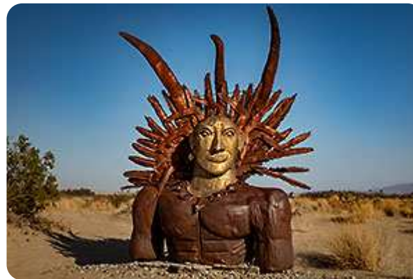
Galleta Meadows - Borrego Springs

tures and have the chance to buy them. They are looking great, but aside the fact that transport to Germany would cost a