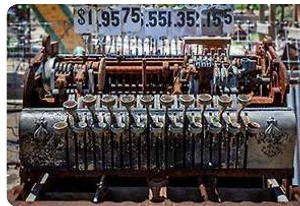
Elmer's Bottle Tree Ranch - Oro Grande

cessible. In the beginning I thought I've missed it, but no, address and coordinates