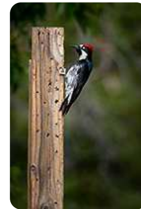
Santa Rita Lodge - Madera Canyon - Tucson