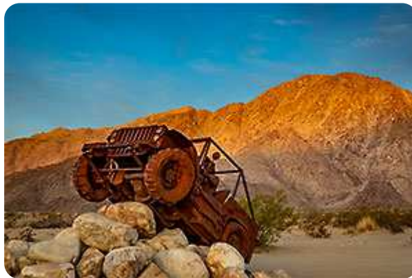
Galleta Meadows - Borrego Springs