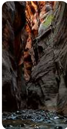
Kanarra Creek - Kanarraville

Even I start before 8am I'm not the first. But it's nothing compared to yesterday. Most of the time I'm on my own. The way is longer than I thought and it's much easier to stay in the water then to try to walk on the river bank. So today I get what I missed so much in the Narrows yesterday.