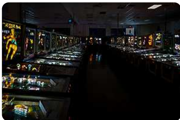
Pinball Hall Of Fame - Las Vegas

I take a brief look at the animals of the Flamingo Casino (my favorites, the cranes are gone) and decide to take breakfast here at the garden restaurant.