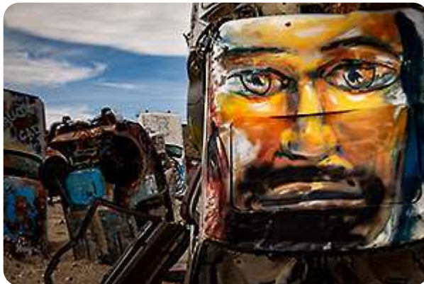
First international car forest of the last church - Goldfield