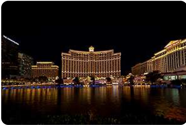
Bellagio - Las Vegas

After two days of driving this will be a quiet day. I get up later than usual and finish my notes from yesterday. Before