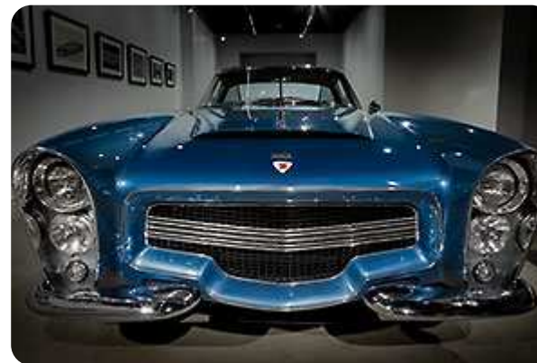
Petersen Automotive Museum - Los Angeles

tersen Museum for nearly 3 hours I'm not in the mood for that. So, I change to plan B and take a tour along Mulholland Drive. It's pretty crowded for the first few miles, but getting better after a while. In the me-