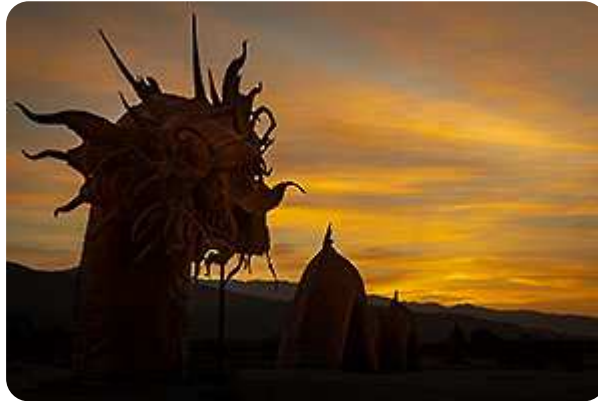
Galleta Meadows - Borrego Springs

Salvation Mountain is an art installation