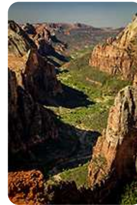
Observation Point - Zion NP

options for a hike). So, I take the shuttle bus to Weeping Rocks and start the hike to Observation Point shortly after 8am. It's an 8 miles round trip, strenuous but not difficult. The path goes straight up most of the time, only the last 500 ft or so are flat, but sandy and without shade. It takes me two hours to reach the top. There are not so many people at the observation point at that time, but a lot are