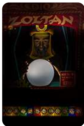
Pinball Hall Of Fame - Las Vegas