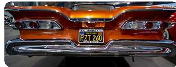
Automobile Driving Museum - Los Angeles

you go through a gate where a picture is taken. That's all, they don't even check the boarding pass.