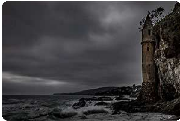
Pirate Tower - Victoria Beach

Highway), but not a single customer in any of them. In exchange for the skipped walks this morning I now go to Victoria Beach. It's around 1,5 miles one-way, but I have to walk along this Highway. Unfortunately, there is no way walking along the beach, especially as the high tide is approaching. Finally, I turn into Victoria Drive and climb down the stairs to the beach. The place I want to go to is called Pirate Tower or sometimes Rapunzel Tower. I'm just in time to reach a spot from where I can take the pictures, a little bit later and the tide would have blocked the way.