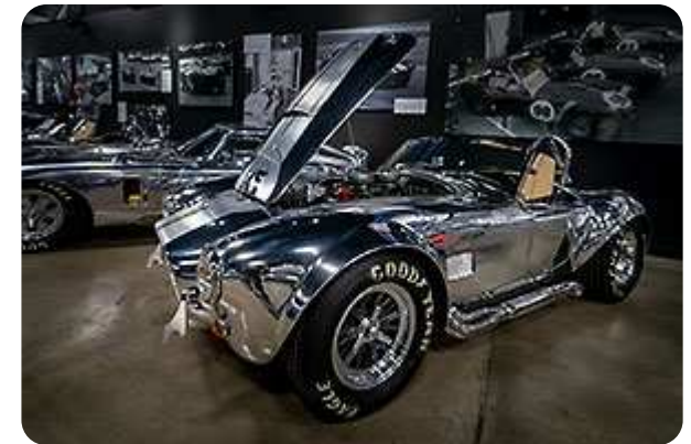
Carroll Shelby Museum - Las Vegas

going for breakfast, I walk over to Mandalay Bay to see what kind of decoration they have this time. Most of the umbrellas