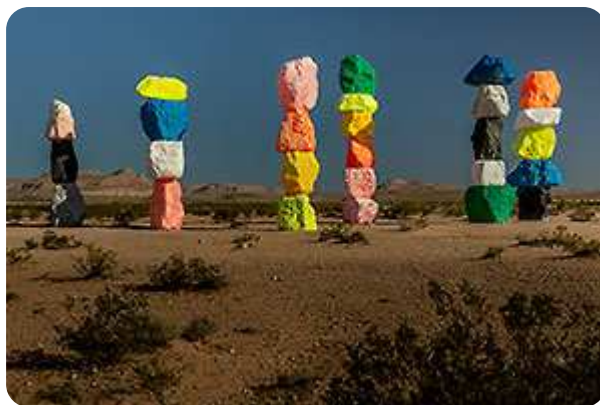
Seven Magic Mountains - Las Vegas

I will go half way to the Pacific today and as I have enough time the plan is to drive