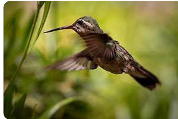
Arizona-Sonora Desert Museum - Tucson