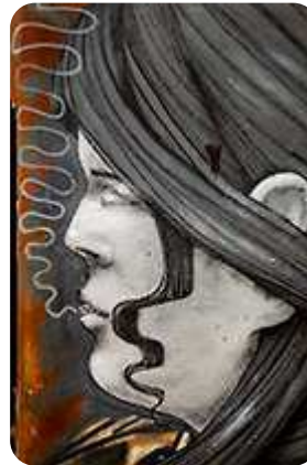
First international car forest of the last church - Goldfield

Some years ago, we've been at Cadillac Ranch in Texas. This is a little bit alike, but while the cars there are all aligned, they are placed here in a way that at least I do not see any concept. But it is fun to walk around and the paintings on the cars are not as chaotic as at Cadillac Ranch, where it is the idea that everyone should spray. Except for one other couple I'm here on my own. It's not a secret tip anymore, but obviously not known to most of the people who just stop in Goldfield for the obvious things.