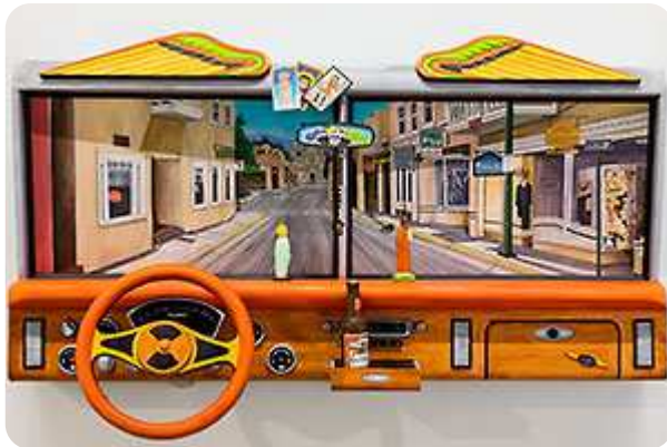
Petersen Automotive Museum - Los Angeles

Griffith Observatory from my to-do list and return to the hotel.