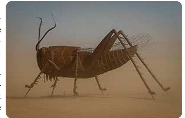
Galleta Meadows - Borrego Springs

Dinner today is at a small Mexican Restaurant (not the one recommended by TripAdvisor, but the other one right across the street). Much better than the Thai yesterday and portions are