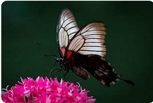
Butterfly Wonderland - Scottsdale

After leaving the Walmart, I start my drive to the North. Today it's just a short