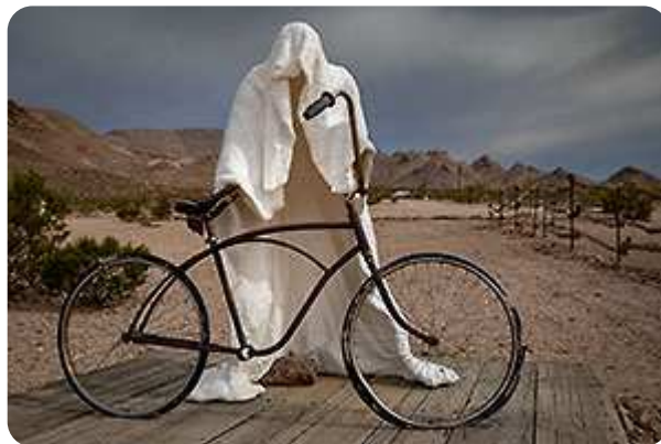
Rhyolite Ghost Town

Anyhow: The Fremont Street is more annoying than anything else. They have two places where cover bands are playing. But