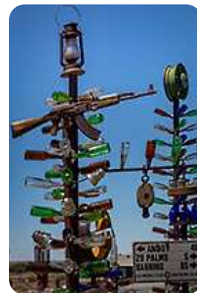
Elmer's Bottle Tree Ranch - Oro Grande

is flat with some slight ups and downs and with forests of cactus-trees left and right. The first intended stop is Cima. What should be a ghost town are one or two buildings with a small area that is not ac-