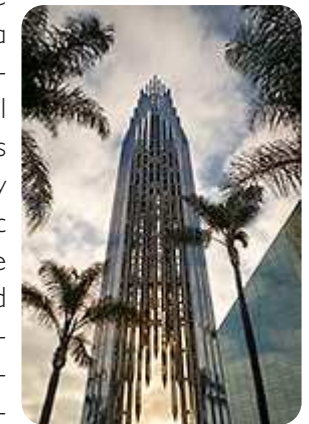
The Christ Cathedral - Garden Grove

Again, I leave the hotel around 7am. Today is mainly a driving day down to the south with the final destination in Borrego Springs. But the first stop is already in Garden Grove near Santa Ana. The former Crystal Cathedral has been bought by the Catholic Church some years ago and is still under renovation. Originally announced for 2016 the reopening will now be only mid of 2019.