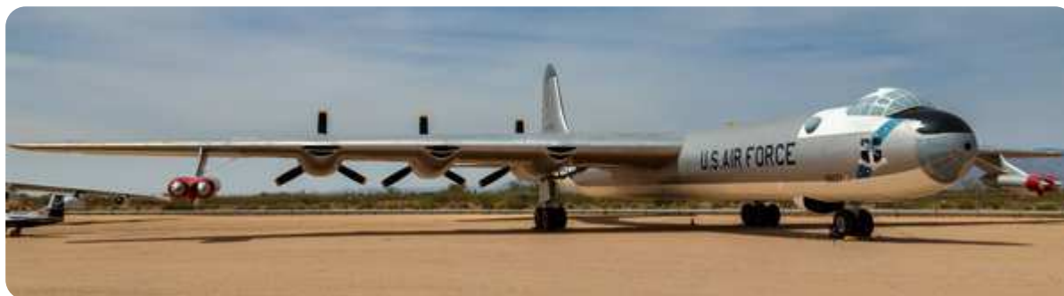
Pima Air and Space Museum - Tucson