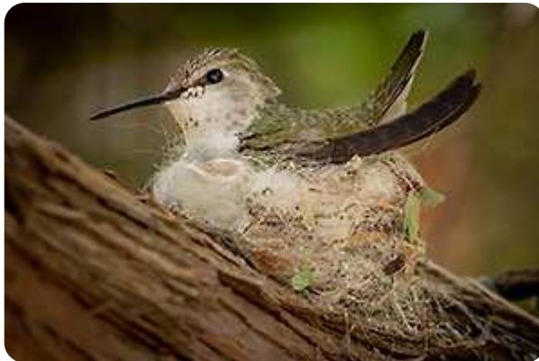
Arizona-Sonora Desert Museum - Tucson

Even if you just want to get a brief overview you will need here at least two hours. If you want to go into details or listen to the staff who is always happy to tell a story, you will obviously need (much)