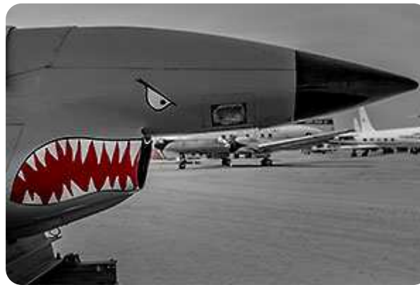
Pima Air and Space Museum - Tucson