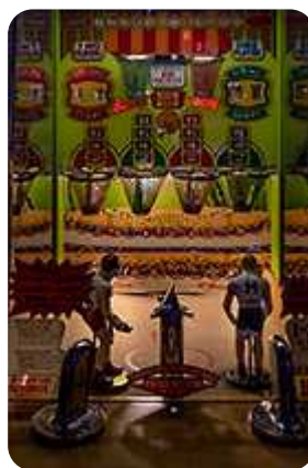
Pinball Hall Of Fame - Las Vegas

Now I'm ready to go for two special museums. Number one is the Carroll Shelby Museum. Shelby was a famous race driver