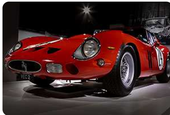
Petersen Automotive Museum - Los Angeles