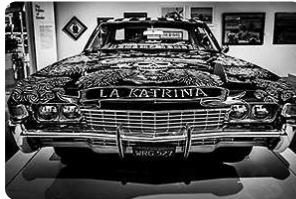
Petersen Automotive Museum - Los Angeles