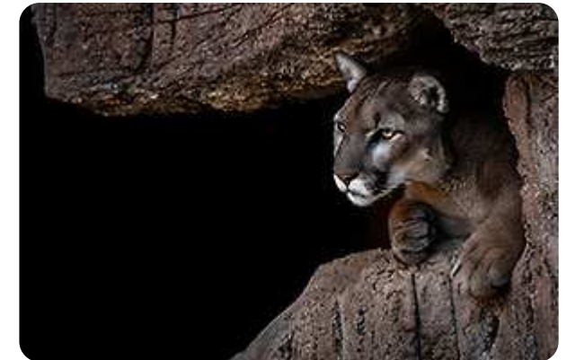
Arizona-Sonora Desert Museum - Tucson

and even it takes longer than the usual buffet it's worthwhile the time to wait.