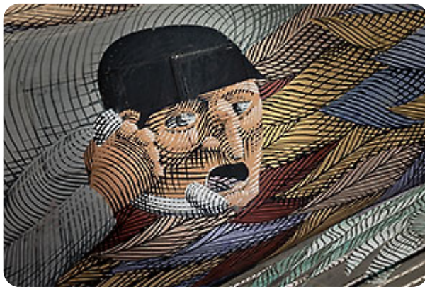
Pima Air and Space Museum - Tucson

With some help she finally found the right menus to enter my name, but then she failed with the address. „Do, you have the address of your hotel here?“ That finally