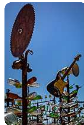
Elmer's Bottle Tree Ranch - Oro Grande