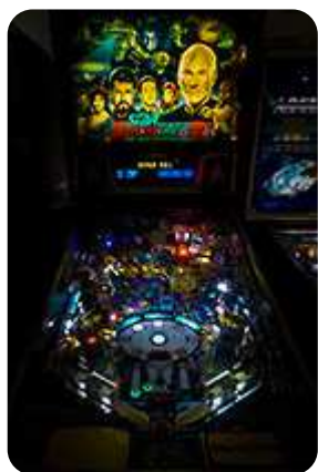
Pinball Hall Of Fame - Las Vegas

Later I go to the Strip for some shots I've planned before, but I return after two hours (much earlier than planned) as it was still too hot and humid outside. Max today was 104°F (40°C) and the weather app claims that it's still in the 90's (~35°C).