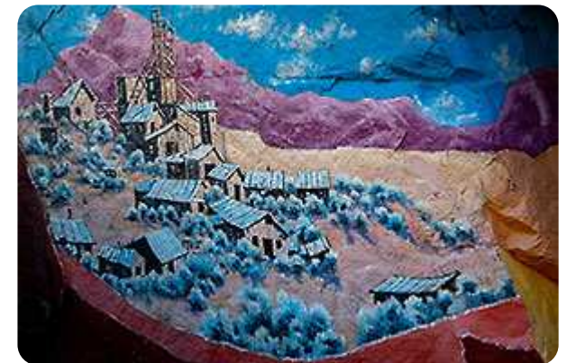
Roy Purcells Rock Murals - Chloride