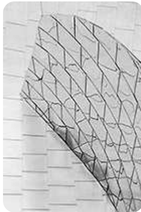
Walt Disney Concert Hall - Los Angeles

Different to other visits in the US Bärbel, our Garmin GPS, locates the satellites before I leave the Alamo station. It avoids the highway for quite some time, but as soon as I enter it I get stuck in a heavy traffic jam (and that at 4 pm). In the end it's no problem to reach my motel in Hollywood.