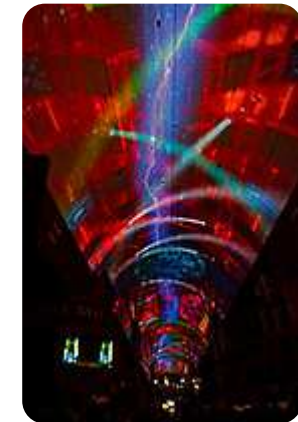
Freemont Street - Las Vegas

The temperature here is back to normal: 99°F (37°C) and it shall stay like that for the upcoming days.